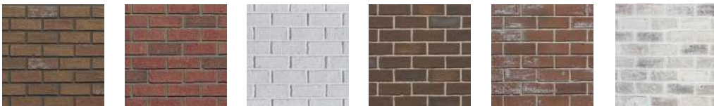
Antique Old Italy Vintage White Cellar Brown Reclaimed Red Lime Wash