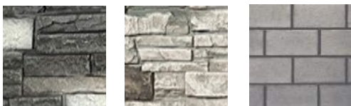
Iron Black Mountain Summit Vintage White