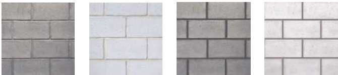
Traditional Washed Grey Traditional Industrial Grey Modern Washed Grey Modern Industrial Grey