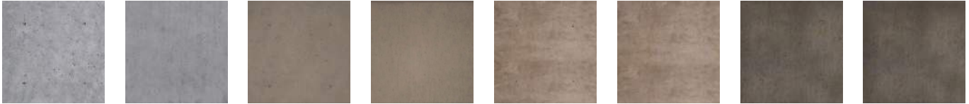
Industrial Grey 'Circles' Industrial Grey 'Flat' Washed Grey 'Circles' Washed Grey 'Flat' Rustic Grey 'Circles' Rustic Grey 'Flat' Onyx Grey 'Circles' Onyx Grey 'Flat'